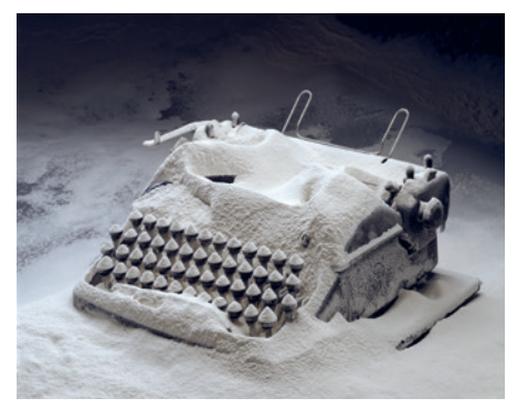
Rodney Graham, Rheinmetall/Victoria 8, 2003 35mm film, color, silent, Cinemeccanica Victoria 8 film projector, 10:50 min, photo: production still © Rodney Graham

Polyester, pigment, height 280 cm, Ø 1300 cm, Emanuel Hoffmann Foundation, on permanent loan to the Öffentliche Kunstsammlung Basel (permanently installed in the Schaulager Basel), photo: Ruedi Walti, Basel, © 2023, ProLitteris, Zurich