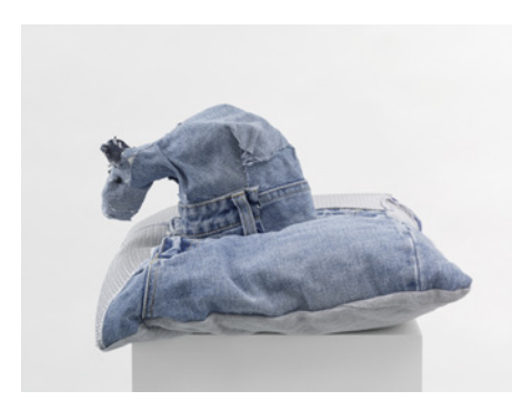
Gina Fischli, Mr. Shoulders, 2022 Fabric, plaster, wire, 24 \times 35 \times 35 cm, Emanuel Hoffmann Foundation, on permanent loan to the Öffentliche Kunstsammlung Basel, photo: Tom Bisig, Basel, © Gina Fischli

All press releases and images can be found on our website www.schaulager.org under 'Media' Installation views of the exhibition OUT OF THE BOX are available for download in the media section of the website.