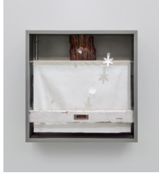
Robert Gober, Unitited, 2020–2021 Cast gypsum polymer, epoxy putty, epoxy resin, wood, glass, oil and acrylic paint, archival paper, and archival tape, 77 × 77 × 34 cm, Emanuel Holfmann Foundation, on permanent loan to the Öffentliche Kunstsammlung Basel Basel, photo: Tom Bisig, Basel, Ø Robert Gober