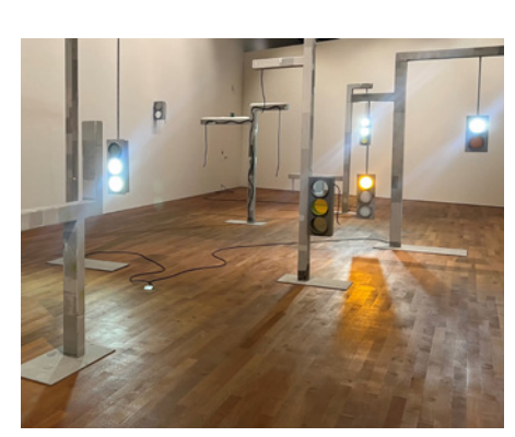
Exhibition view: Peter Fischli, Ohne Titel, 2022–2023 OUT OF THE BOX, 10 June to 19 November 2023, Schaulager® Münchenstein/Basel, Exhibition view with 7 works by Peter Fischli, wood, coated, color, cardboard, metal, LED-lights, glass, electronic compinents, glass, cable, polyurethane, for 2 sculptures: Courtesy the artist, © Peter Fischli, ohoto: Peter Fischli / Artist's image