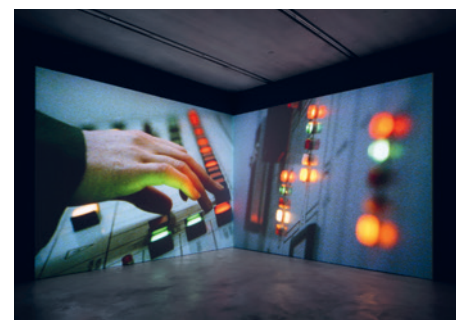
Jane & Louise Wilson, Gamma, 1999 4-channel video installation, color, stereo, 16mm color film transferred to HD video, 4 x 6:11 min, Emanuel Hoffmann Foundation, on permanent loan to the Öffentliche Kunstsammlung Basel