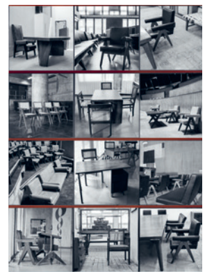
Dayanita Singh, Let's Talk Again, 2023 Teak panel and archival pigment prints, 12 parts, 45.7 × 45.7 cm each / 190.5 × 137 × 5 cm overall, photo: Courtesy the artist and Frith Street Gallery, London, © Dayanita Singh

Two-channel HD video projection on two transparent screens and 14-channel sound installation, color, 20:45 min, Courtesy the artist, still: Courtesy Galerie Chantal Crousel, Paris; Marian Goodman Gallery, New York; Hauser & Wirth, Zurich/London Courtesy the artist, © 2023, ProLitteris, Zurich