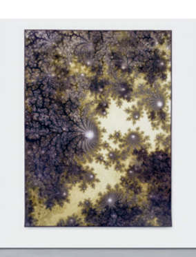
Thomas Ruff, d.o.pe. 07, 2022 Colaris on velour carpet, 267 × 200 cm, Ed. 2/4 + 1 AP, Emanuel Hoffmann Foundation, on permanent loan to the Öffentliche Kunstsammlung Basel