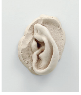
Robert Gober, Untitled, 2008 Cast gypsum polymer, 38 × 26.5 × 15.5 cm, Emanuel Hoffmann Foundation, on permanent loan to the Öffentliche Kunstsammlung Basel, © Robert Gober