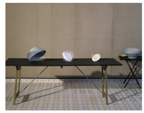
Thomas Demand, Trick, 2004 35mm color film, silent, 1 min., Ed. 1/2 + 1 AP, Emanuel Hoffmann Foundation, on permanent loan to the Öffentliche Kunstsammlung Basel