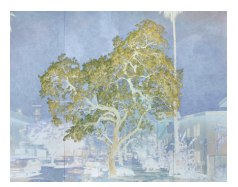
Tacita Dean, Purgatory (Threshold), 2020 Colored pencil on Fuji Velvet paper mounted on paper, 372 × 468.5 cm, Emanuel Hoffmann Foundation, on permanent loan to the Öffentliche Kunstsammlung Basel, photo: Stephen White and Co, Courtesy the artist and Frith Street Gallery © Tacita Dean