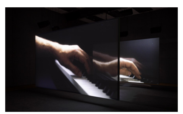
Exhibition view: Anri Sala, Ravel Ravel Interval, 2017 OUT OF THE BOX, 10. Juni bis 19. November 2023, Schaulager® Münchenstein/Basel, Ausstellungsansicht mit Anri Sala, Ravel Ravel Interval, 2017, 2-Kanal HD-Videoprojektion auf zwei transparente Leinwände und 14-Kanal Toninstallation, Farbe, 20:45 Min., Courtesy the artist, © 2023, ProLitteris, Zurich, Foto: Gina Folty, Basel