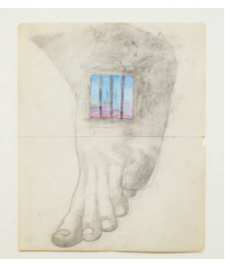
Robert Gober, Last One, 2021 Graphite, colored pencil, pastel, collaged paper on found drawing, 17.5 × 21.3 cm, Emanuel Hoffmann Foundation, on permanent loan to the Öffentliche Kunstsammlung Basel