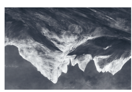
Tacita Dean, Inferno, 2019 (detail) Chalk on masonite, 242 × 1219 cm, Emanuel Hoffmann Foundation, on permanent loan to the Öffentliche Kunstsammlung Basel