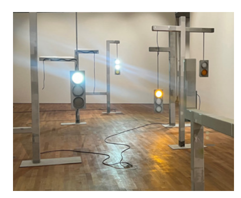
Exhibition view: Peter Fischli, Ohne Titel, 2022–2023 OUT OF THE BOX, 10 June to 19 November 2023, Schaulager® Münchenstein/Basel, Exhibition view with 7 works by Peter Fischli, wood, coated, color, cardboard, metal, LED-lights, glass, electronic compinents, glass, cable, polyurethane, for 2 sculptures: