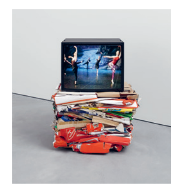
Klara Lidén, Warm-up: State Hermitage Museum Theater , 2014 Cardboard, color video, sound, Hantarex, 4:20 min, 105 × 95 × 80 cm, Emanuel Hoffmann Foundation, on permanent loan to the Offentliche Kunstsammlung Basel, photo: Tom Bisig, Basel, © Klara Lidén

All press releases and images can be found on our website www.schaulager.org under 'Media' Installation views of the exhibition OUT OF THE BOX are available for download in the media section of the website.