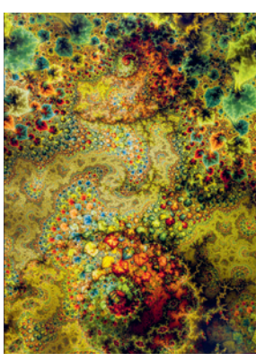
Thomas Ruff, d.o.pe. 01, 2022 Colaris on velour carpet, 267 × 200 cm, Ed. 2/4 + 1 AP, Emanuel Hoffmann Foundation, on permanent toan to the Öffentlore Kunstsammlung Basel