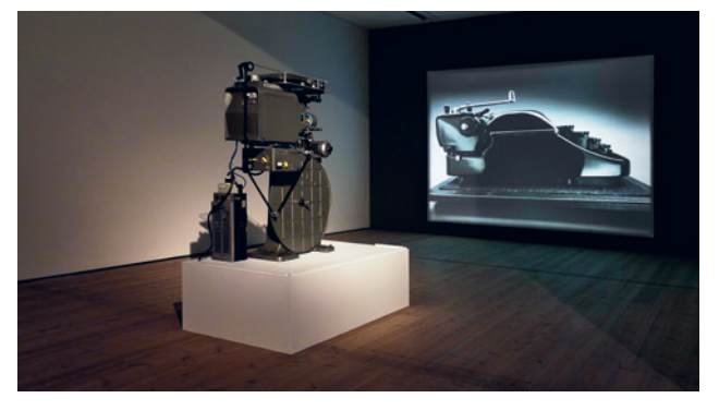
Rodney Graham, Rheinmetall/Victoria 8, 2003 35mm film, color, silent, Cinemeccanica Victoria 8 film projector, 10:50 min, exhibition view BALTIC Centre for Contemporary Art, Gateshead, 2017, photo: John McKenzie, © Rodney Graham