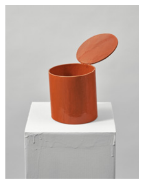
Peter Fischli, Untitled, 2019 From the series "Cans, Bags & Boxes", Cardboard, newspaper, enamel paint, 121 × 23.2 × 23.2 cm, Emanuel Hoffmann Foundation, on permanent loan to the Öffentliche Kunstsammlung Basel